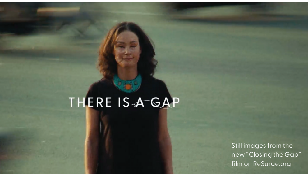
Still images from the new “Closing the Gap” film on ReSurge.org