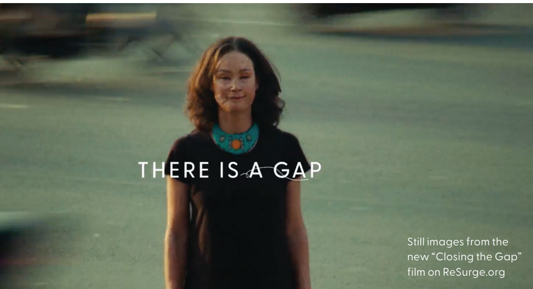
Still images from the new "Closing the Gap" film on ReSurge.org